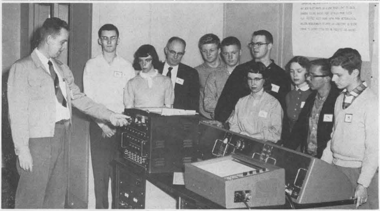
RAYPAC COMPUTER, nuclear blast wave predictor designed and built at Sandia Corporation, was an item of interest to more than 90 science students from Albuquerque high schools who toured some

Anyone interested in taking any of the classes is urged to contact Orientation Section 3123-1, Bldg. 849, ext. 29238 for further information or registration blanks.